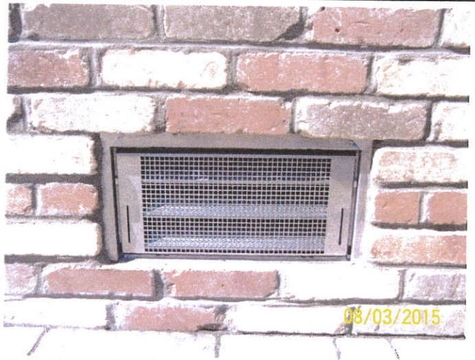
Vent View – Date of Photograph: (See Photo Stamp)